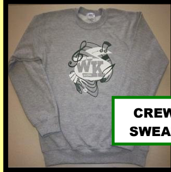
CREW NECK SWEATSHIRT