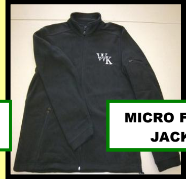
MICRO FLEECE JACKET