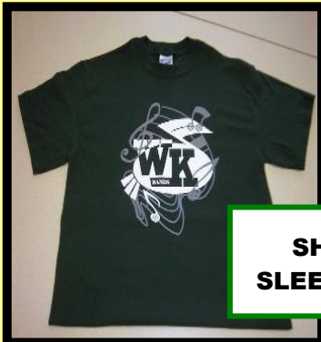
SHORT SLEEVE TEE