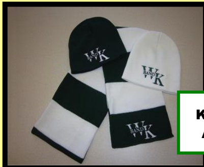
KNIT BEANIE AND SCARF