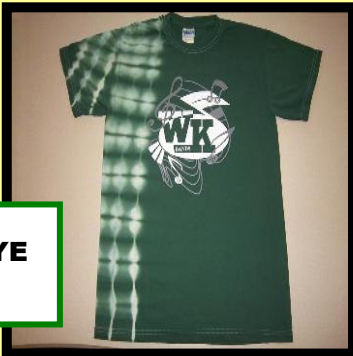
TYE DYE TEE