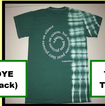
TYE DYE TEE (back)