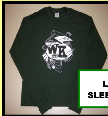
LONG SLEEVE TEE